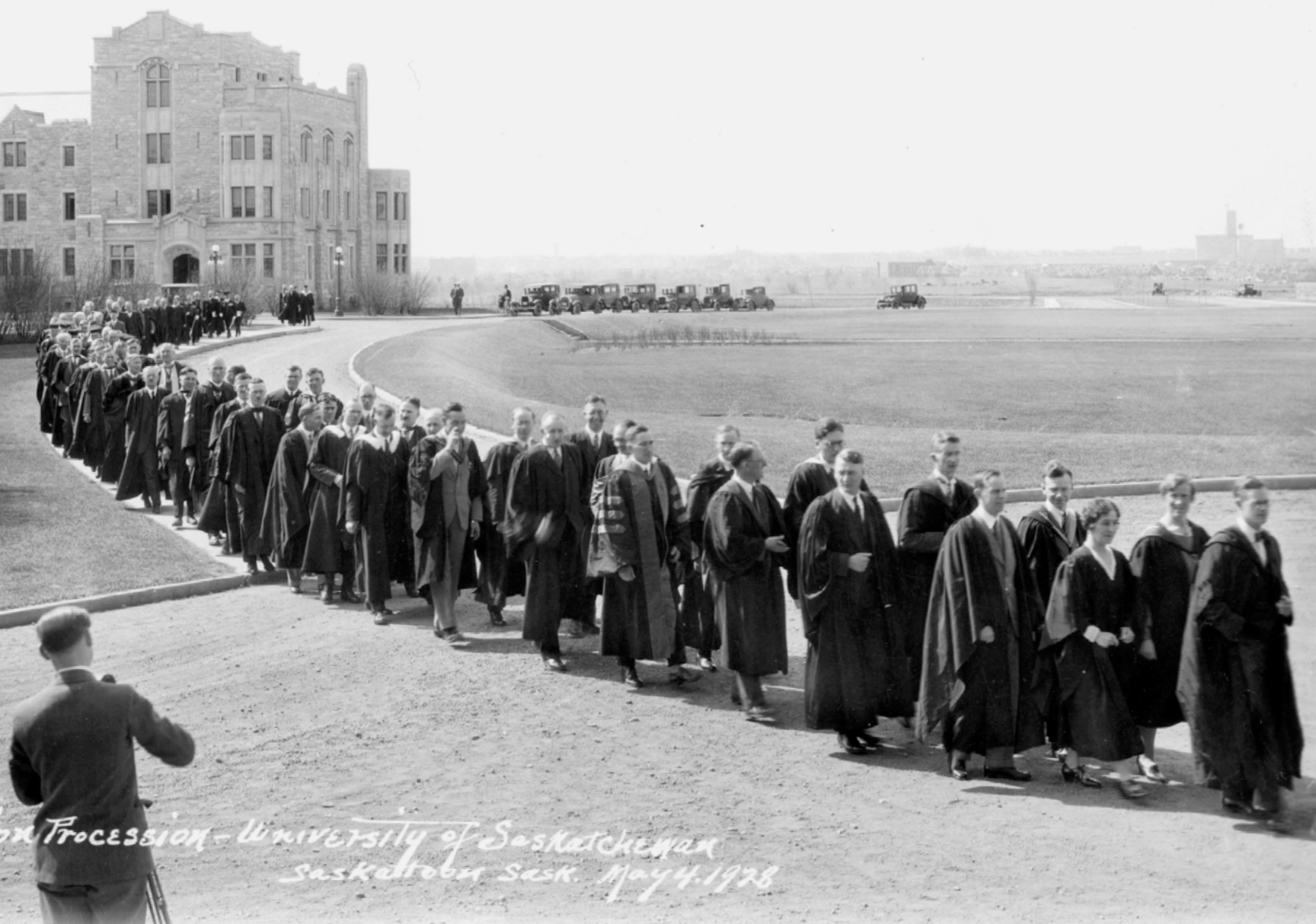
Convocation procession in the Bowl, May 1928. A-1666

PROCESSION - University of Saskatchewan Saskatoon Sask. May 4, 1928