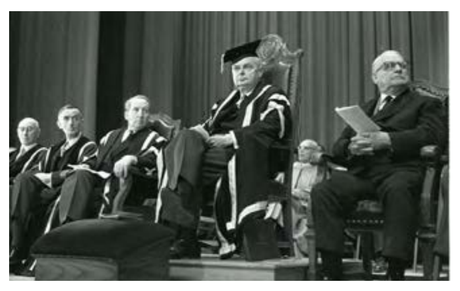
John G. Diefenbaker (above) presides over convococation ceremonies in 1969 (A-7752). Graduates (below) line up for the hooding ceremony stage while the platform party looks on (A3535).

Scheduled to open in the fall, the facility will feature two full-size ice surfaces, two full-size basketball courts and will also be available to host concerts and community events in addition to our own convocation ceremonies.