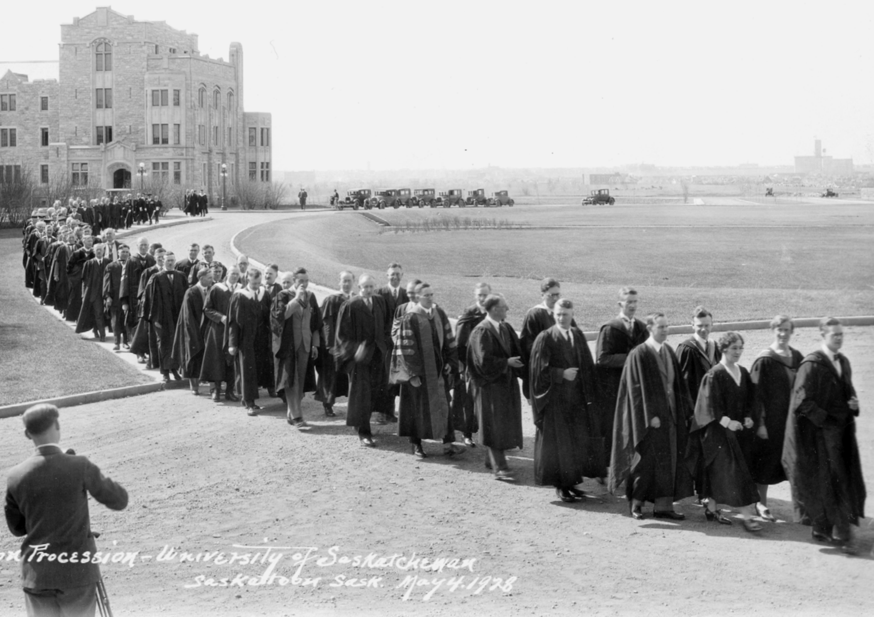
Convocation Procession - University of Saskatchewan Saskatoon Sask. May 4, 1928