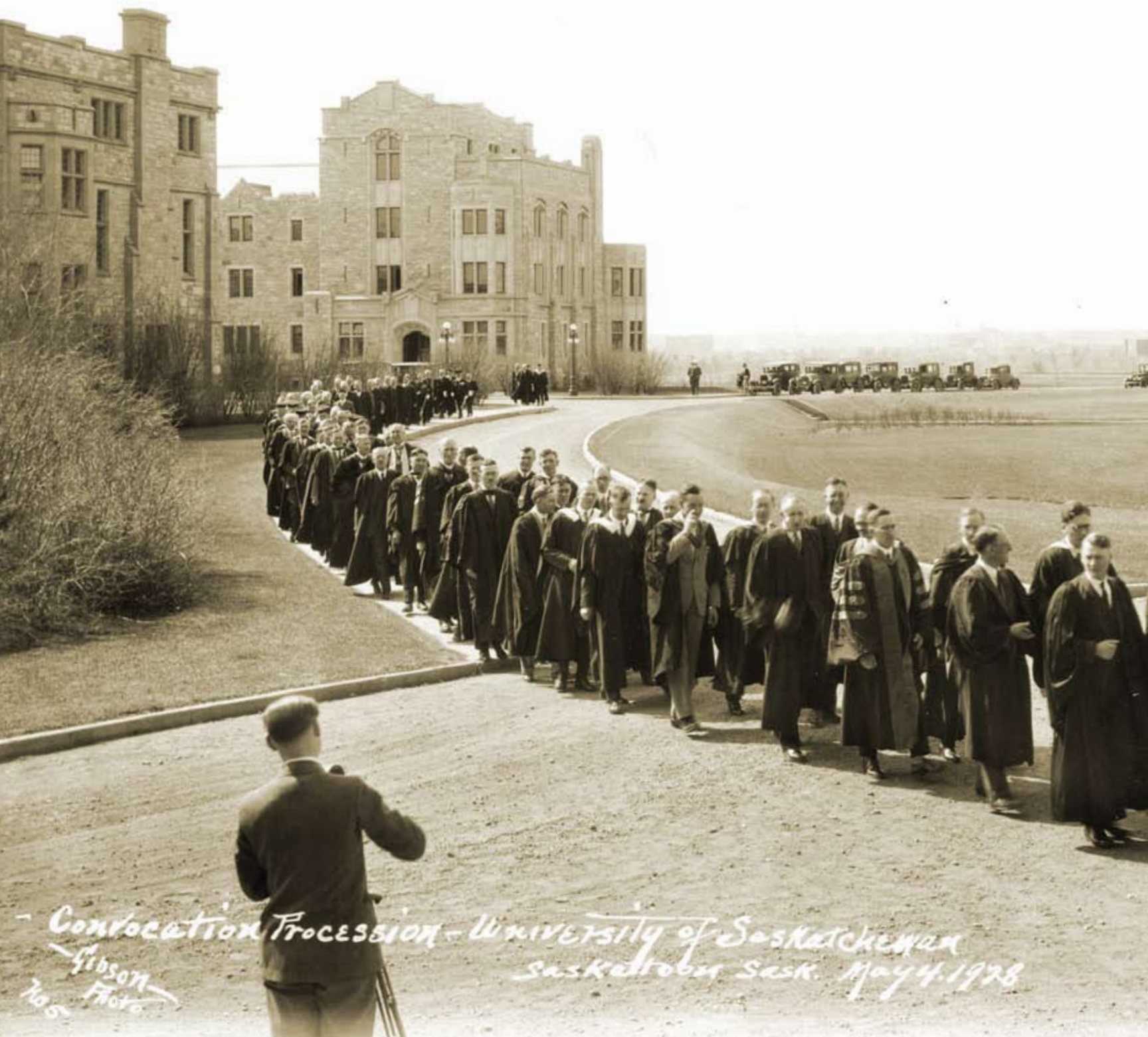
Convocation Procession - University of Saskatchewan Saskatoon Sask. May 4, 1928