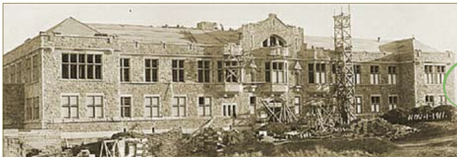
College Building construction takes shape, November 1911. A-23

From the beginning, the University established an emphasis on research and teaching in a context of community service, and encouraged co-operation among departments and divisions in tackling common problems. The development of rust-resistant strains of wheat, for example, initiated by the University and federal and provincial research agencies, has been of untold value to the prairie economy.