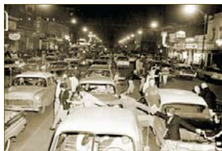
University students snake dance through downtown traffic, 1950s. A-6267