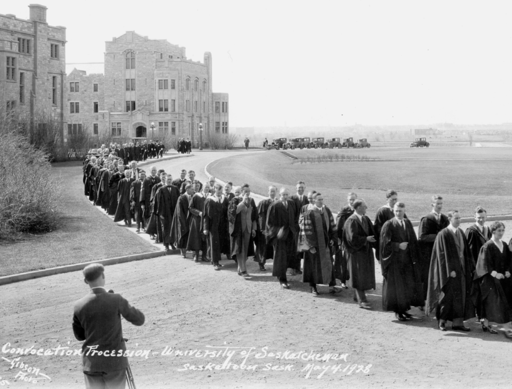
Convocation Procession - University of Saskatchewan May 4, 1928