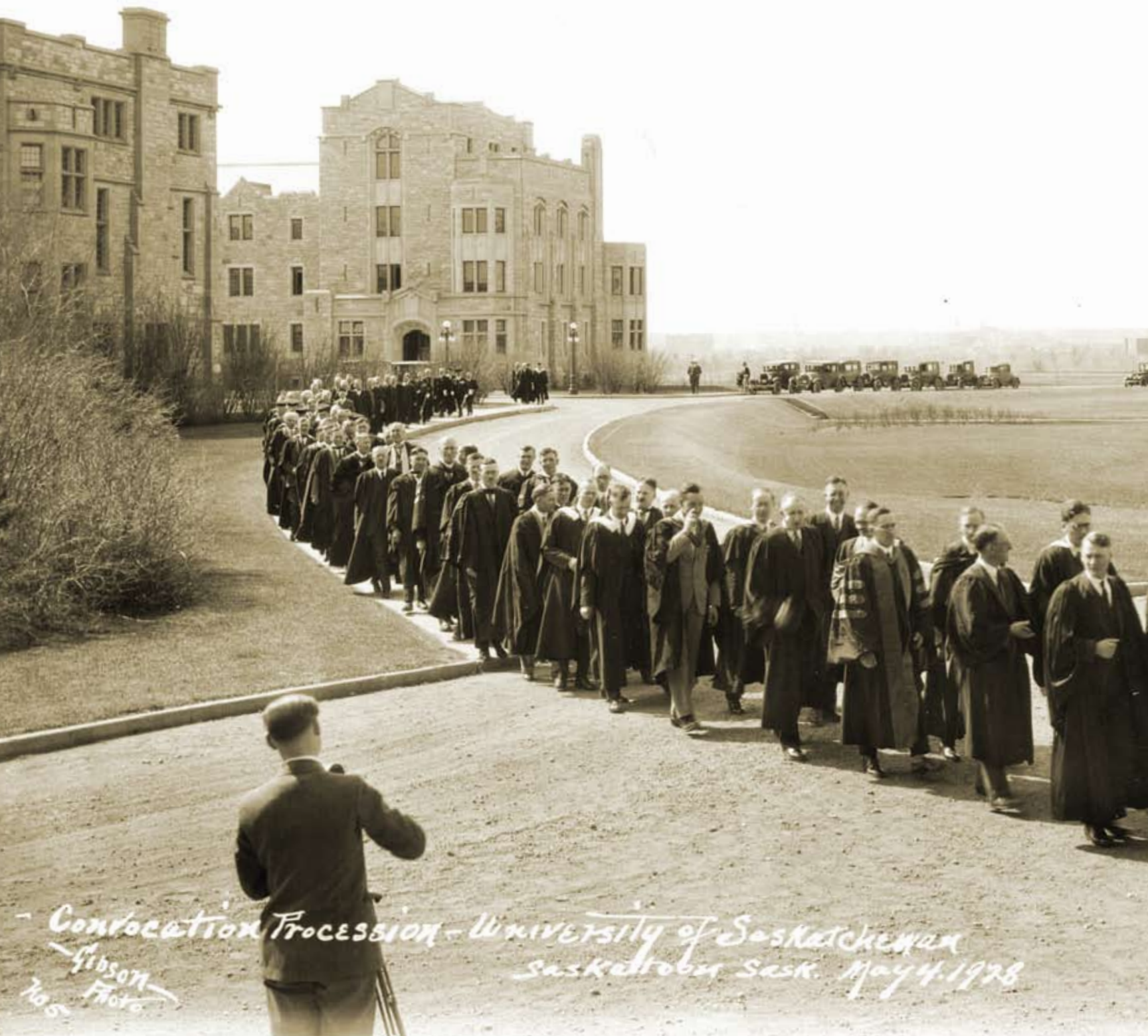
Convocation procession in the Bowl, May 1928. A-1666

Convocation Procession - University of Saskatchewan Saskatoon Sask. May 4, 1928