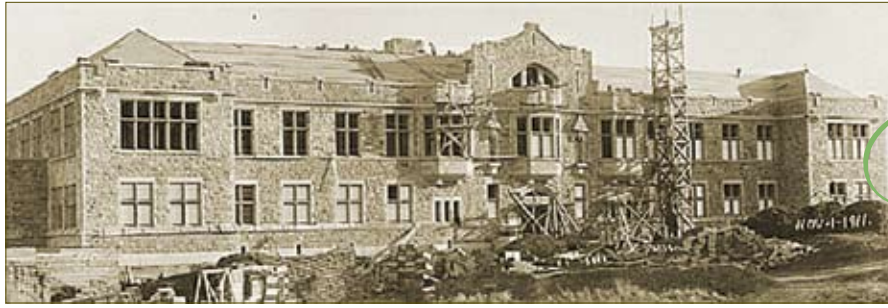
College Building construction takes shape, November 1911. A-23

From the beginning, the University established an emphasis on research and teaching in a context of community service, and encouraged co-operation among departments and divisions in tackling common problems. The development of rust-resistant strains of wheat, for example, initiated by the University and federal and provincial research agencies, has been of untold value to the prairie economy.