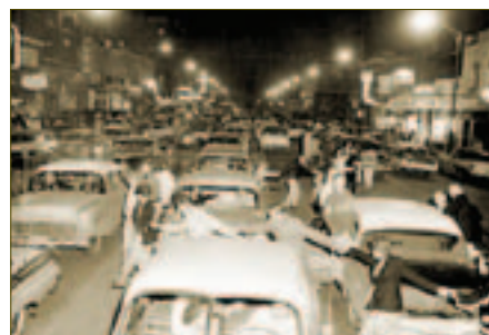
University students snake dance through downtown traffic, 1950s. A-6267