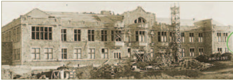
College Building construction takes shape, November 1911. A-23

From the beginning, the university established an emphasis on research and teaching in a context of community service, and encouraged co-operation among departments and divisions in tackling common problems. The development of rust-resistant strains of wheat, for example, initiated by the university and federal and provincial research agencies, has been of untold value to the prairie economy.