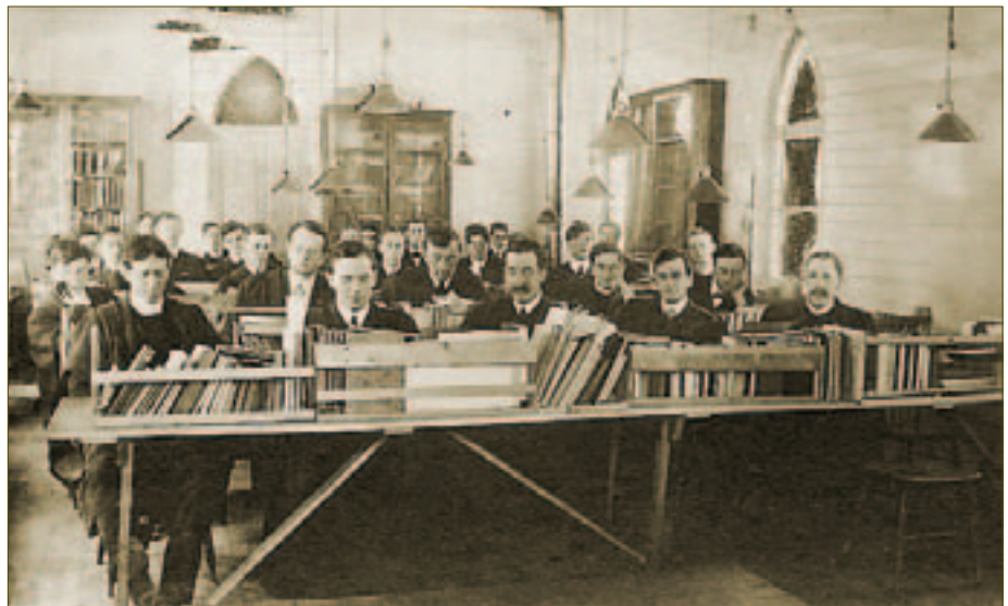
Emmanuel College students in the classroom, 1920. A-1606

In 1912, the U of S honoured its first graduating class of seven students. The ceremony was held at Nutana Collegiate. At this year's convocation spring and fall ceremonies, we will honour nearly 4,000 new graduates.