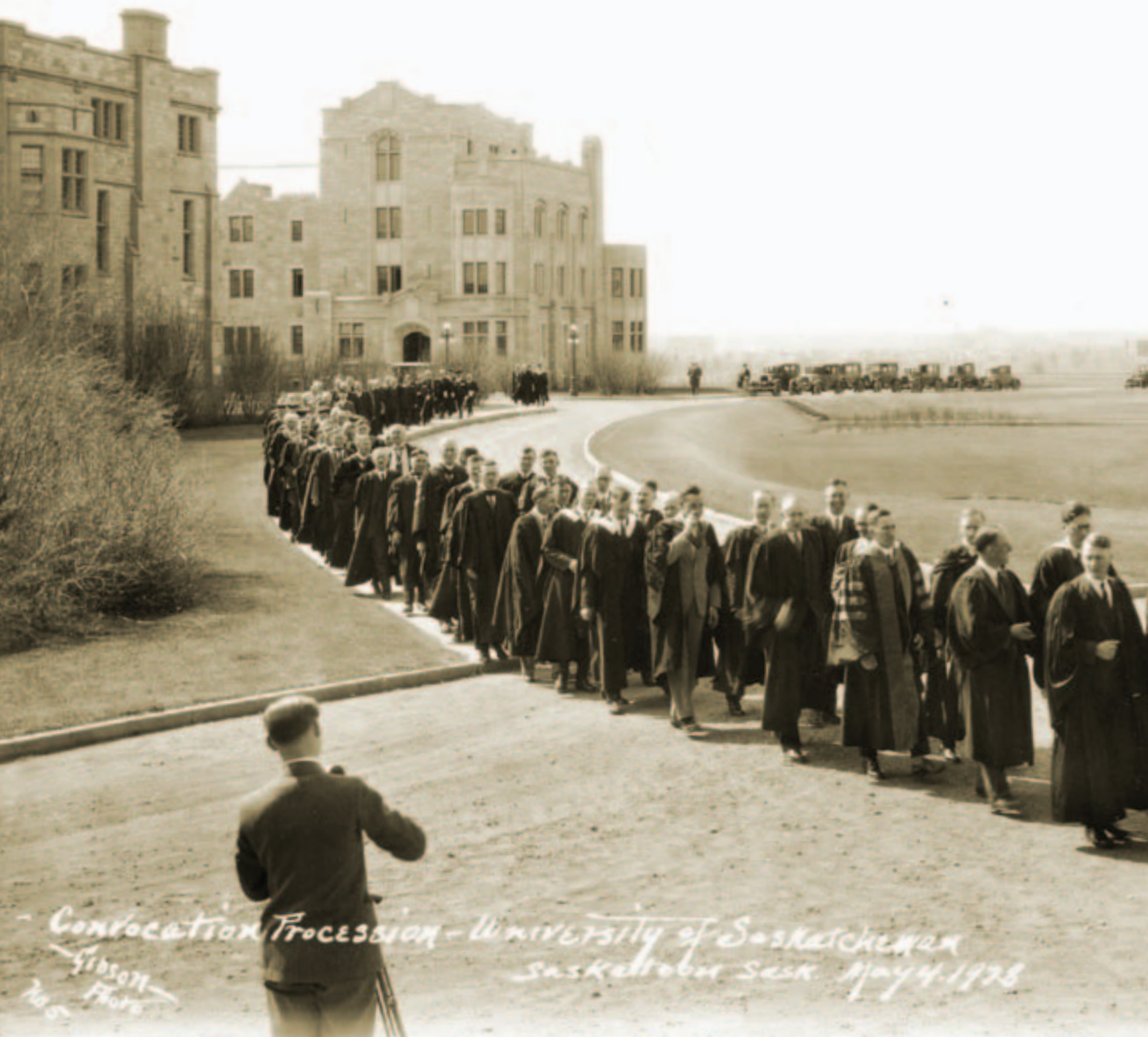
Convocation procession in the Bowl, May 1928. A-1666