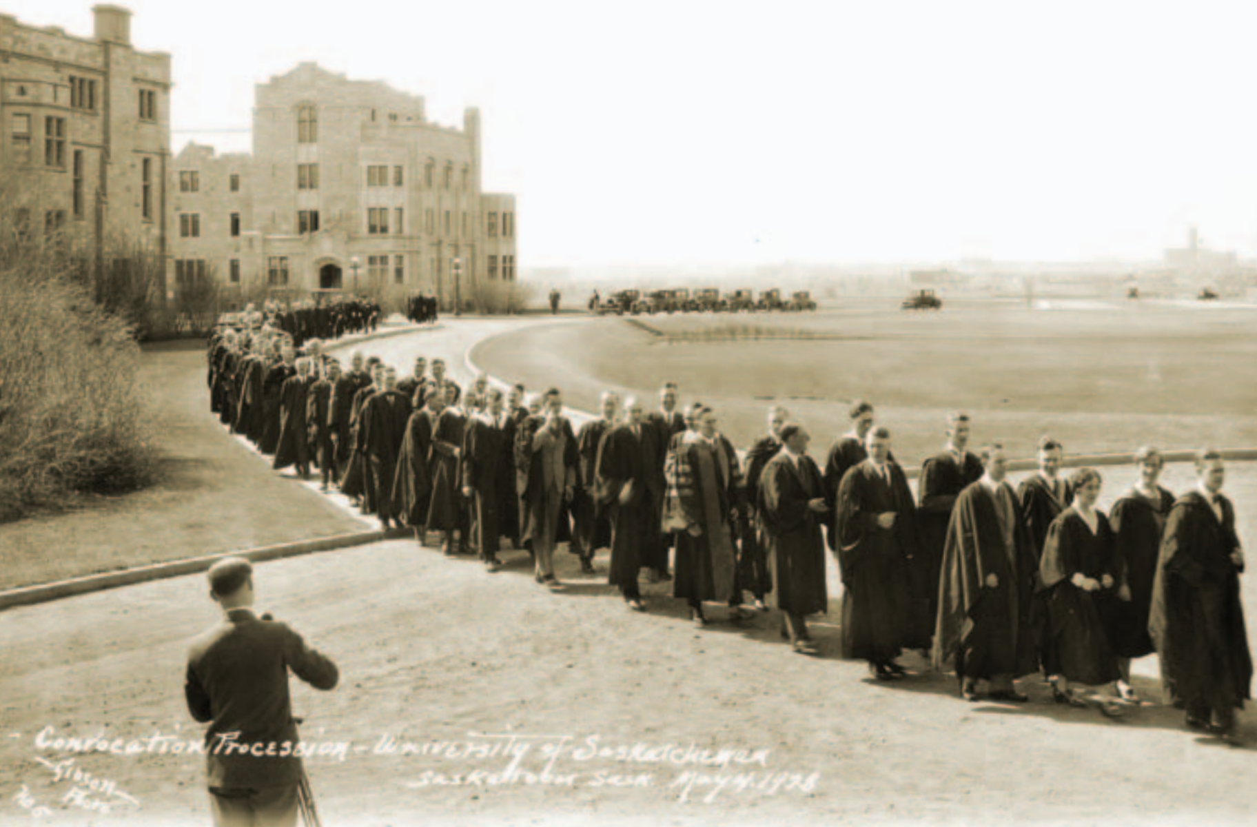
Convocation procession in the Bowl, May 1928. A-1666