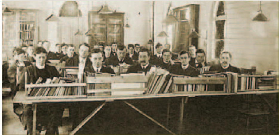
Emmanuel College students in the classroom, 1920.

In 1912, the U of S honoured its first graduating class of seven students. The ceremony was held at Nutana Collegiate. At this year's convocation spring and fall ceremonies, we will honour nearly 4,000 new graduates.