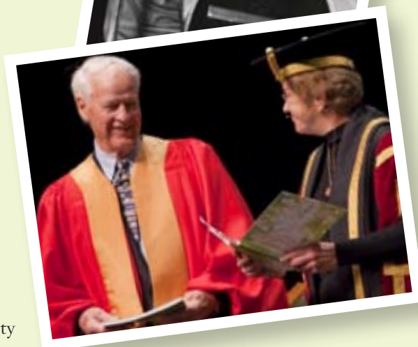
Honorary degree recipients, (top) J.G. Diefenbaker, 1958 (A-1714), and Gordie Howe, 2010.