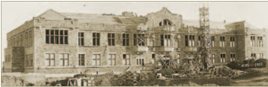
College Building construction takes shape, November 1911. A-23

From the beginning, the university established an emphasis on research and teaching in a context of community service, and encouraged co-operation among departments and divisions in tackling common problems. The development of rust-resistant strains of wheat, for example, initiated by the university and federal and provincial research agencies, has been of untold value to the prairie economy.