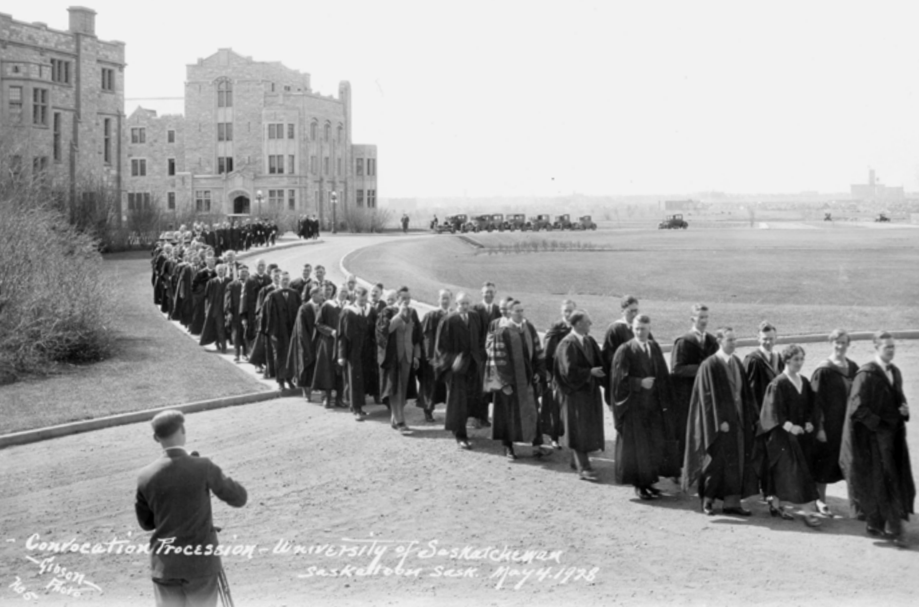
Convocation Procession - University of Saskatchewan May 4, 1928