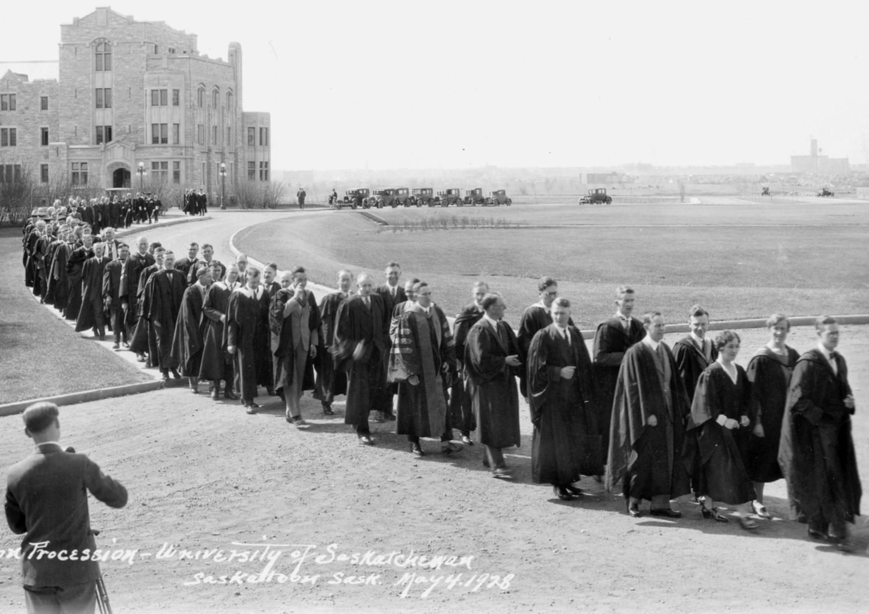
Convocation Procession - University of Saskatchewan Saskatoon Sask. May 4, 1928